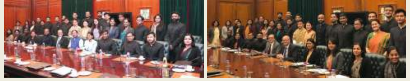
IFS OTs call on Hon'ble MoS for External Affairs

IFS OTs call on FS VIDESH SEWA | OCT-DEC 2019 1