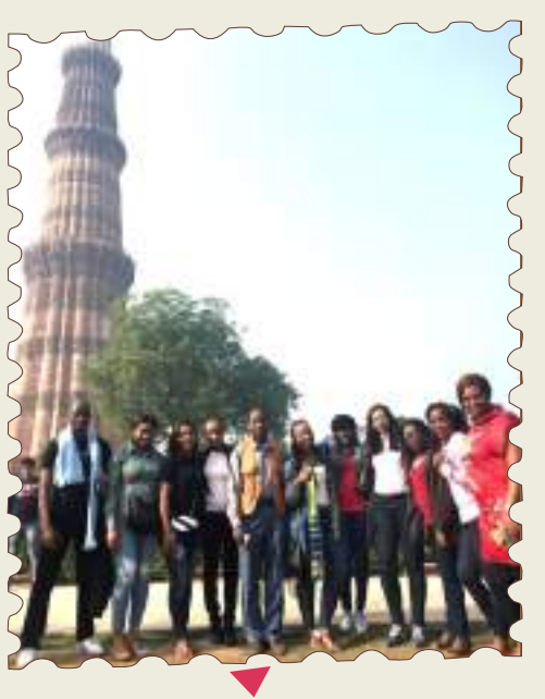
Participants of Central & West Africa Francophone countries visited Qutab Minar, Delhi.

Visit of Mongolian, Maldivian and Dominican Republic participants to Taj Mahal, Agra