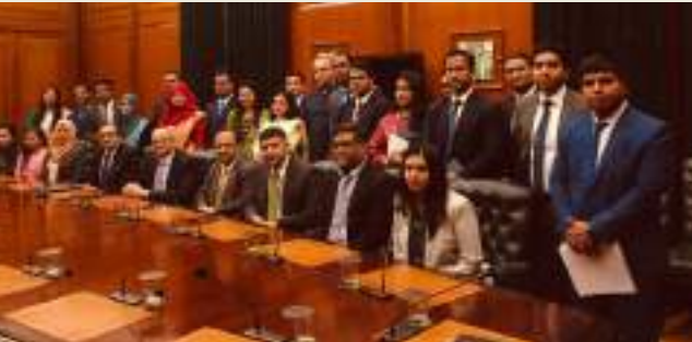
Bangladeshi diplomats called on Shri Vijay Gokhale, Foreign Secretary.