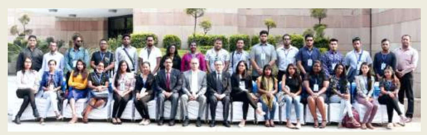
Participants of the 56th KIP visited FSI on 17 October 2019.

Know India Programme (KIP) is a flagship initiative for diaspora engagement which familiarises Indian-origin youth (18-30 years) with their Indian roots and contemporary India, through a 25 days orientation programme organised by MEA. 3 KIP groups underwent a one-day familiarisation programme at FSI in October-December 2019.