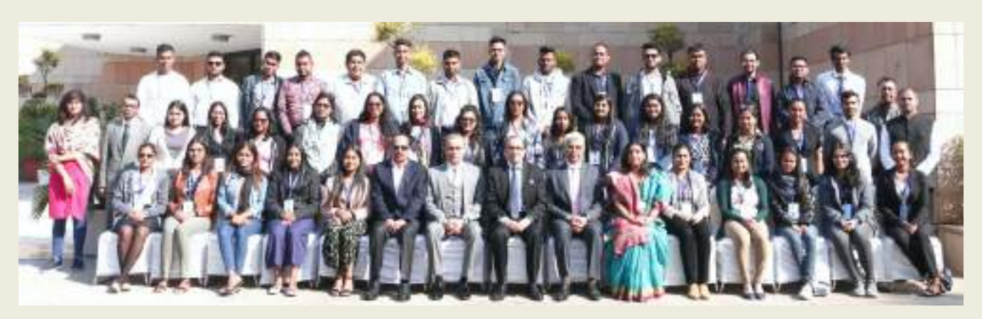
Participants of the 58th KIP visited FSI on 2 December 2019.