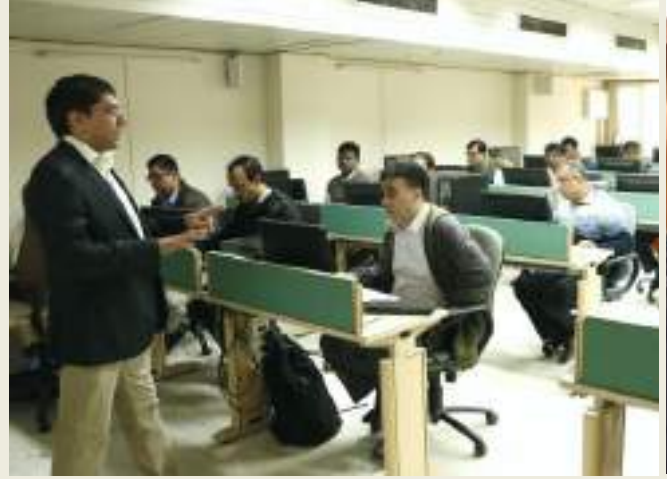
Participants of IMAS undergoing hands-on training