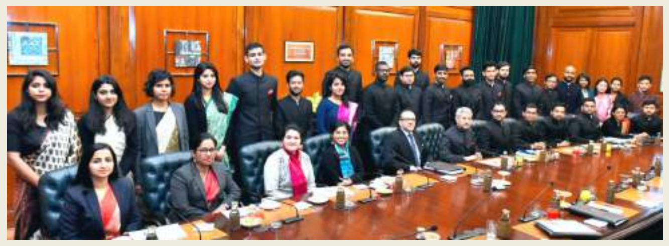
IFS OTs call on Hon'ble EAM