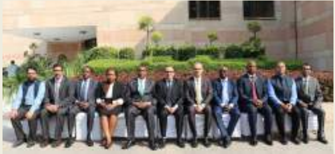
Republic of Ethiopia to India called on Dean (FSI) on 23 December 2019 to discuss cooperation in the area of training between India and Ethiopia.