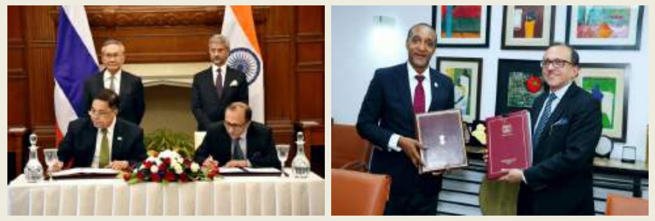
Signing of MoU with Thailand