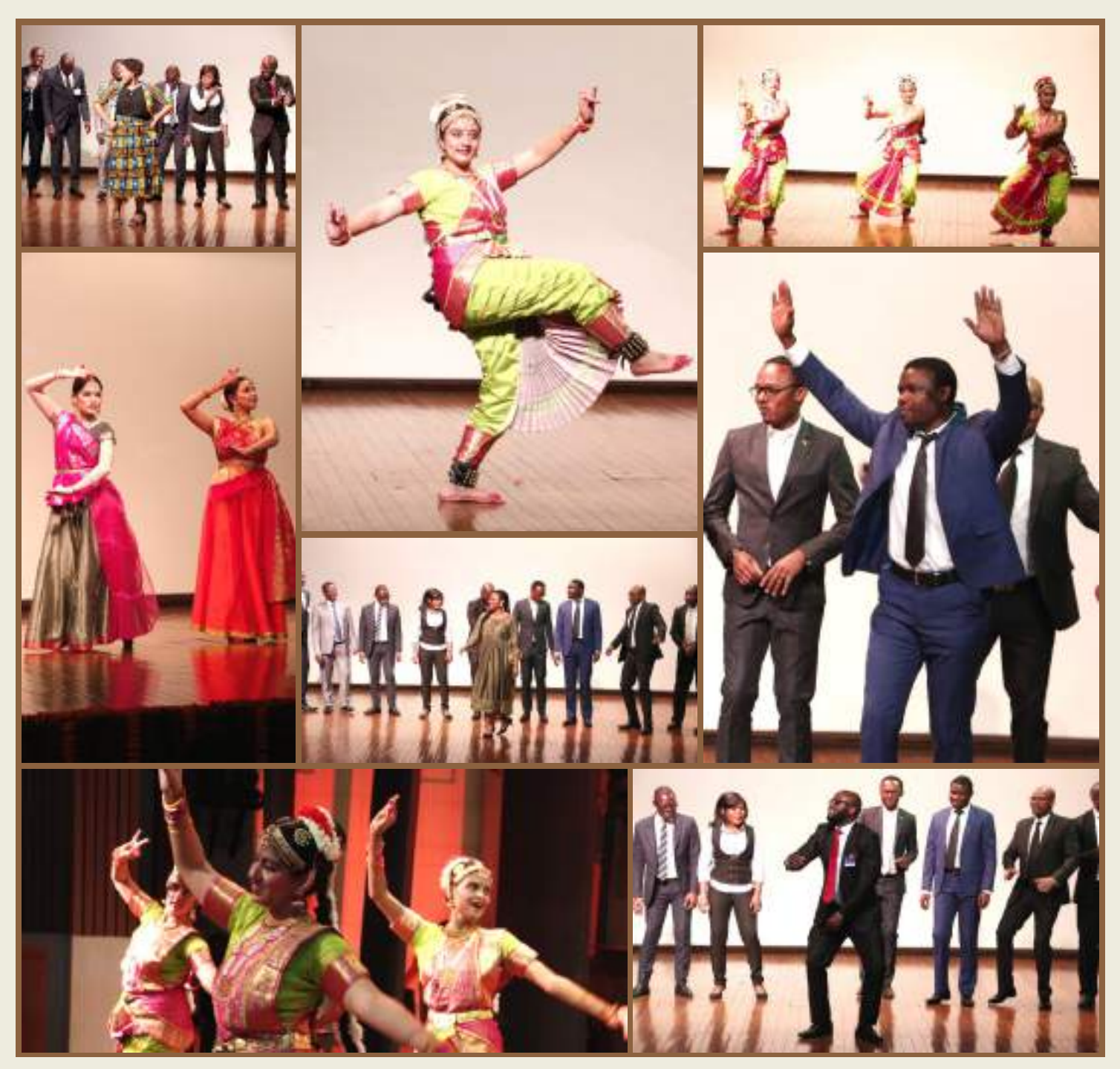
A cultural programme was organised during the valedictory function of 68th PCFD on 11 October 2019. Participating diplomats also put up a couple of performances.