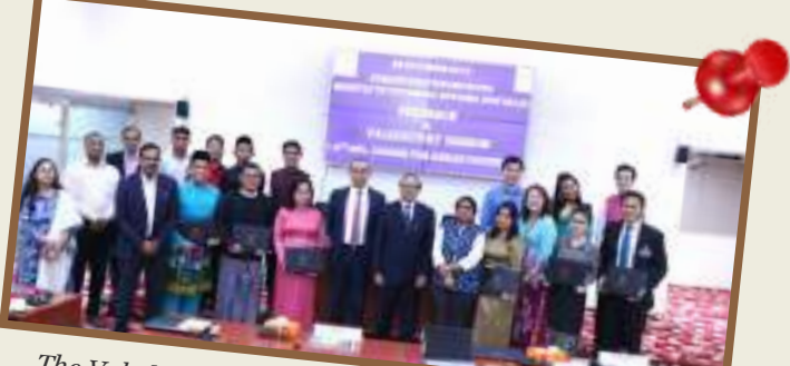
The Valedictory session of 13th Special Course for Diplomats from ASEAN region held on 25 October 2019.