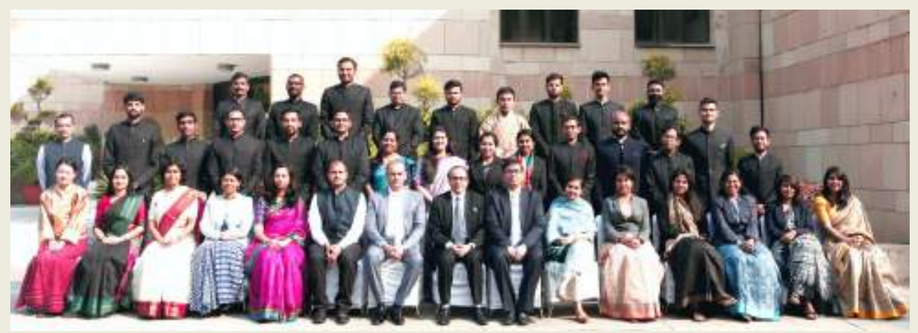
The first day of IFS OTs at FSI

The Induction Training Programme (ITP) for 30 Indian Foreign Service (IFS) Officer Trainees (OTs) and 2 diplomats from Bhutan commenced on 09 December 2019 at FSI. The OTs and Bhutanese diplomats called on Dr. S. Jaishankar, Hon'ble External Affairs Minister (EAM), Shri V. Muraleedharan, Hon'ble Minister of State for External Affairs (MoS) and Shri Vijay Gokhale, Foreign Secretary (FS). The orientation module of the ITP concluded in end-December 2019.