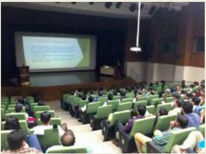
Accounts Training session in progress